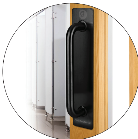
Stericore Pull Bar