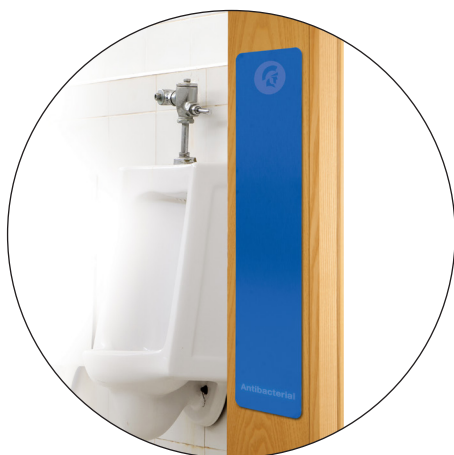
Stericore Finger Plate

Patent Protected. All test results and kill times available on request.