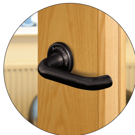
Stericore Lever Handle

60 minute fire rated - supplied in pairs